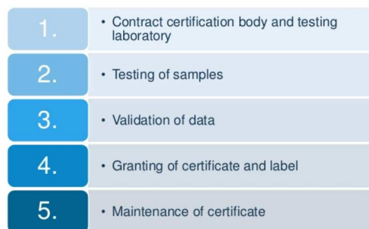
FIGURE 2 GENERAL PROCESS FOR CERTIFICATION AND LABELLING

Other than CEN standards and TS or TR there are also several ecolabel systems worldwide (e.g. Europe’s Ecolabel and Germany’s Blauer Engel) that can be more or less dedicated to certifying bio-based materials. Indeed, some of these schemes such as RSB 4 , ISCC+ and “Better Biomass” 5 are certifying the source of the biomass. In this regards, the European Funded project Open-Bio FP7 6 reported as one of its main output that a single label for certifying bio-based content of a product/material would not be of much use for consumers due to the complexity and variety of those products in the market. Open-Bio therefore proposed to modify the already existing EU Ecolabel to consider the criteria of the sustainable source of biomass. In the same line, the dedicated bio-based label launched in 2011 in the US by the Biopreferred Programme 7 has supported the public and private bio-procurement US programs specifying criteria for about 110 different product categories. The general process for certification and labelling that IBMC would require is depicted on Figure 2.